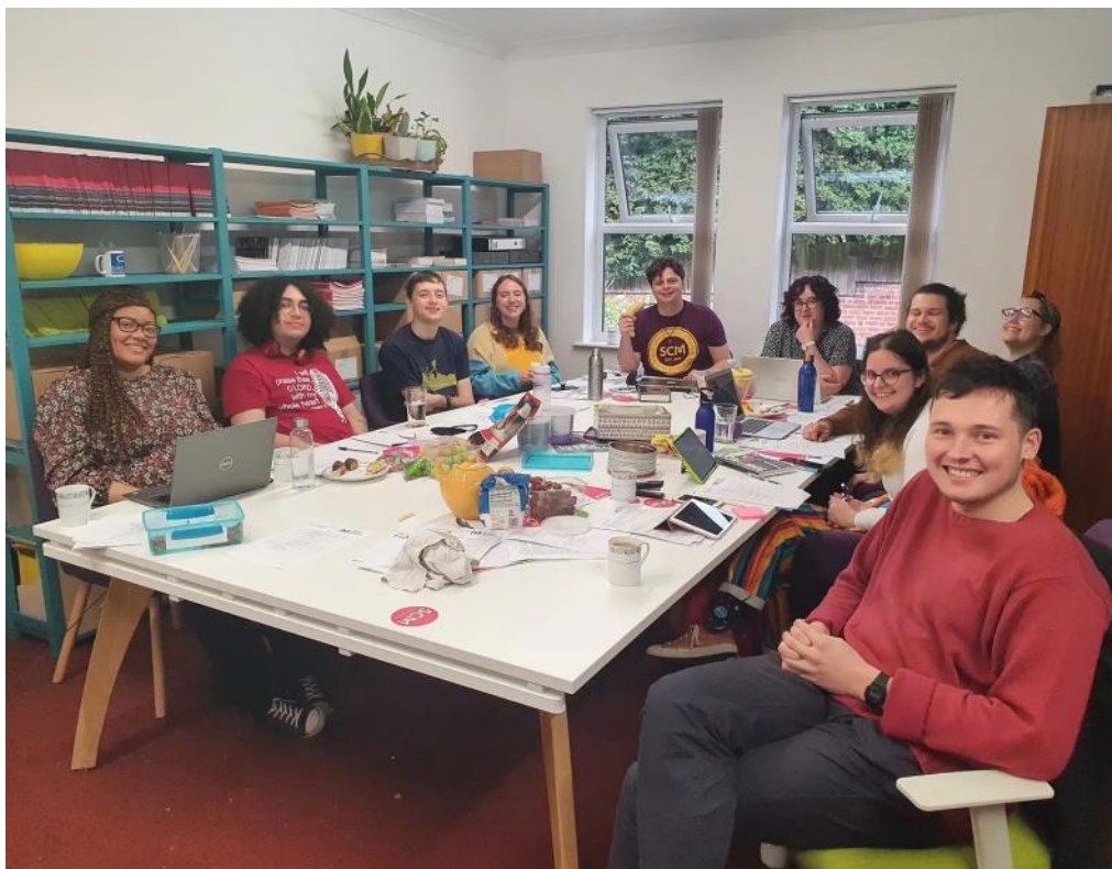
Some of the current General Council and members of the staff team at the October 2021 GC meeting.