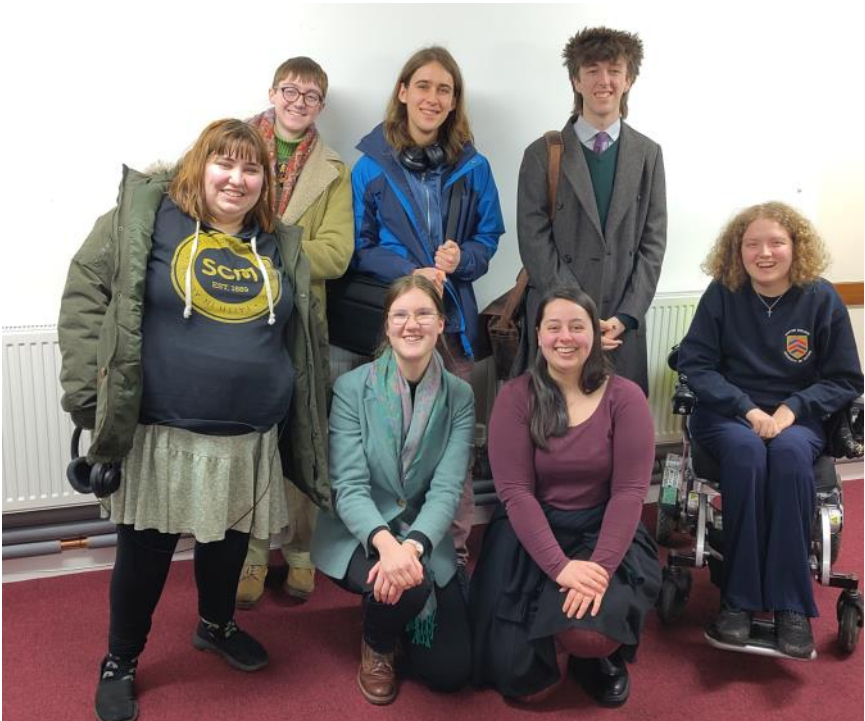
Some of the current General Council at the February 2025 GC meeting.